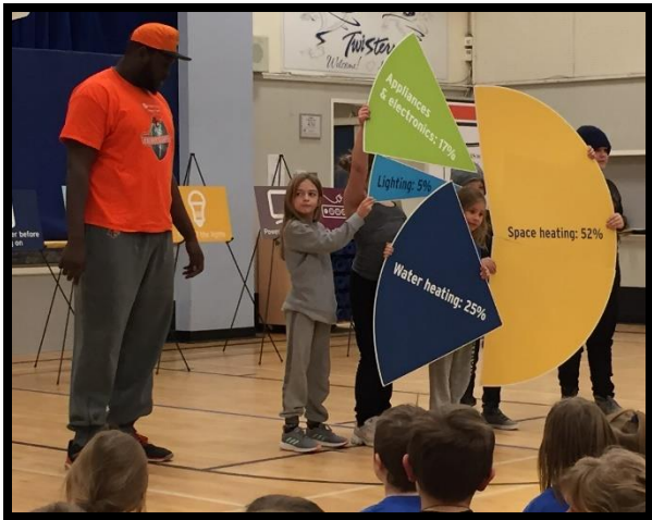
A couple of members from the BC Lion's came to teach our students about ways to save energy.